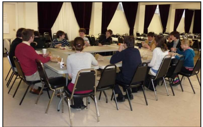
The new table arrangement for lunch time.

Over all, the new "My Life for Yours" lunches have produced much fruit, providing a forum for the students to work out the practical implications of their Christian faith. We look forward to seeing what ideas will result from these lunches in the future.